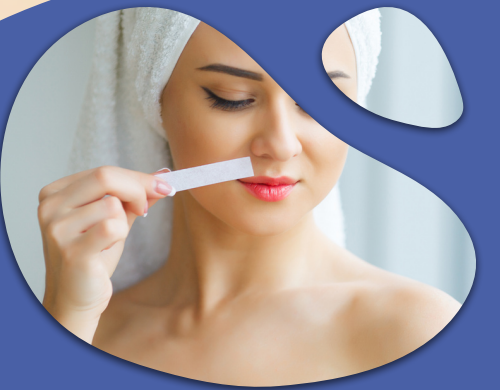
Facial hair removal