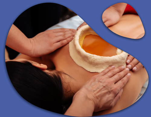
Back Pain Treatment