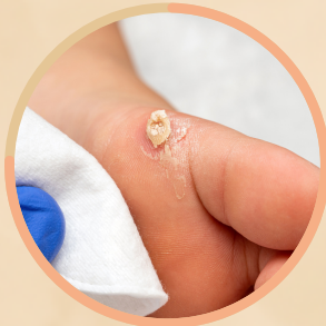
Foot corn treatment